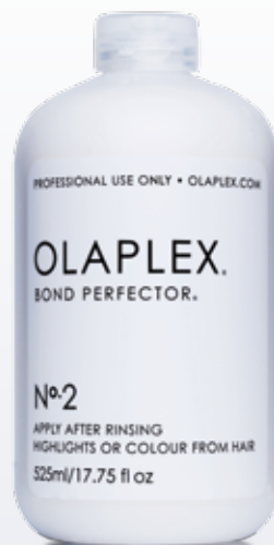
OLAPLEX NO. 2 BOND PERFECTOR

Add to lightener or other chemical treatment before applying to hair.