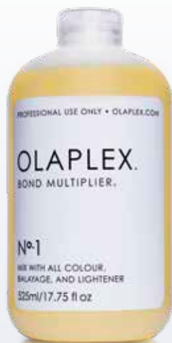
OLAPLEX NO. 1 BOND MULTIPLIER

It may all sound like the same old mumbo jumbo, but check out what top colourists are saying about Olaplex all over social media. Tens of thousands of clients worldwide agree, check out the #olaplexau hashtag for proof of the amazing transformations that Olaplex makes possible.