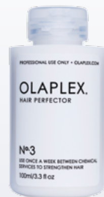
OLAPLEX NO. 3 HAIR PERFECTOR

Apply to hair after rinsing colour but before shampooing to restore structure of hair.